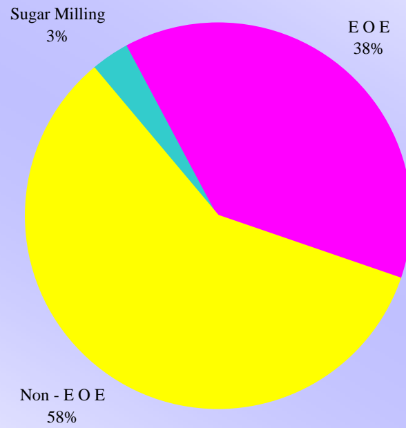
FIG I : VALUE ADDED IN THE MANUFACTURING SECTOR - 2007