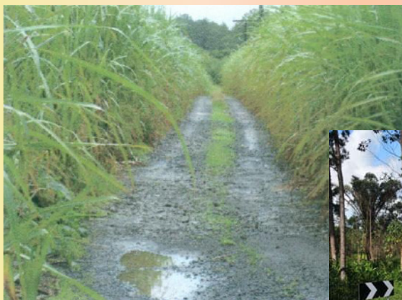
The old track road ...

Another project, aiming at easing traffic from upper Plaines Wilhems towards Moka and Flacq districts, is the upgrading of the Wooton-Quartier Militaire (B6) road. Phase 1 of the project, covering 2.4 km from Wooton to Belle Rive, was completed last year. Works for Phase 2, stretching from Belle Rive to Quartier Militaire over 6.6 km, are due to start by mid-year.