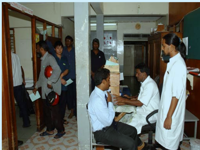
NCD scening now a basic element of health care

It will be recalled that 50% of the population in Mauritius are town dwellers and due to the growth and expansion of urban zones there is a high risk of an increase in the number of health problems associated with urbanisation which may also impact on the natural and cultural environment, on social conditions and ultimately on the health determinants of Mauritians.