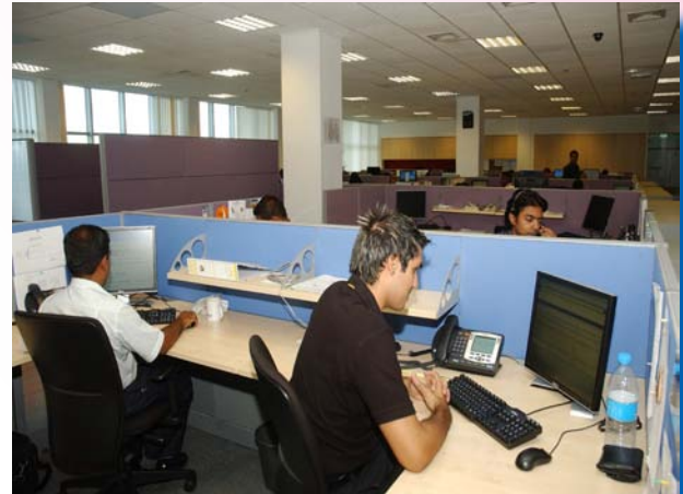
BPO activities - A fast emerging sector

The presentation of the web portal was followed by a workshop designed for stakeholders of the ICT sector. The aim was to assess the current state of the industry and finalise the State of Information Society Development Report. Discussions focused on ICT infrastructure and the digital divide, development of ICT exports and manpower requirements for the ICT Sector.