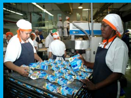
Women constitute 35% of the workforce

It will be recalled that for year 2008, 519 000 people were in employment for a labour force of 559 000 and the number of unemployed stood at 40 400.