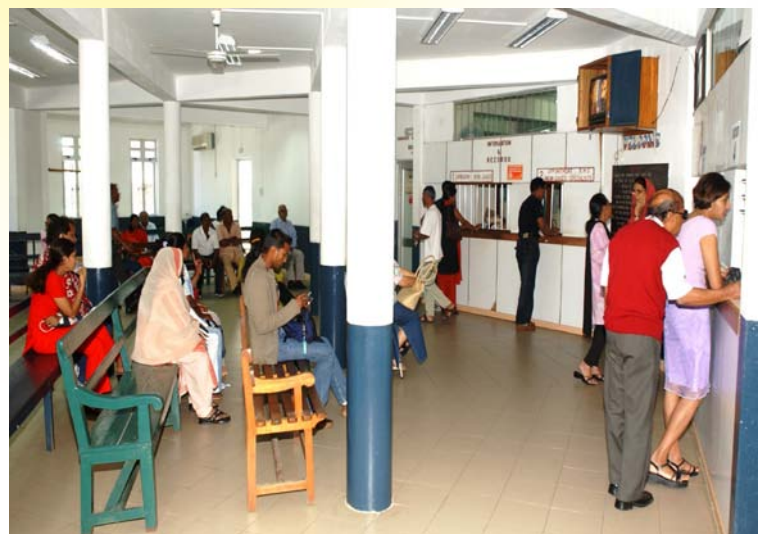
The Casualty department - A high risk area

It will be recalled that an average of about 8 000 patients visit the hospitals daily and the public health sector has a total workforce of some 15 000 officers.