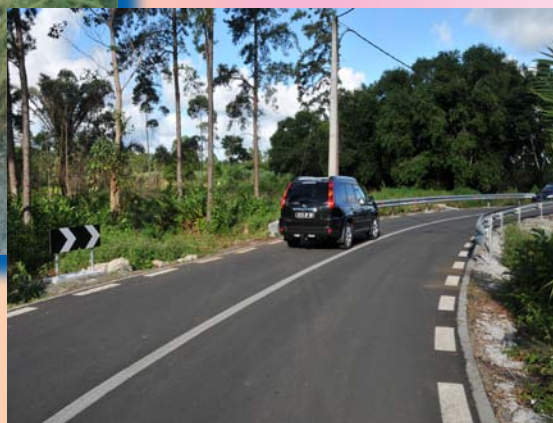
... and the new road