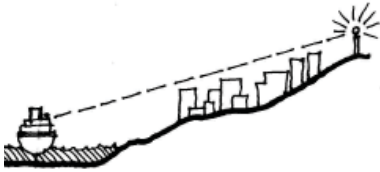
Height controls to maintain clear connection to navigation signals