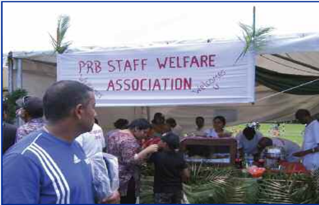
Sale of food items at Gymkhana Vacoas