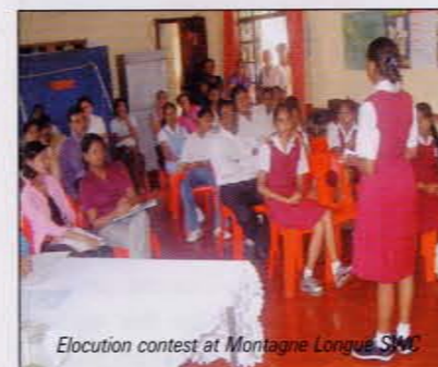
Elocution contest at Montagne Longue SMC

Nowadays, we can see many social scourges which are jeopardising our society. People are more inclined to fall in the tentacles of those scourges as there is a race for wealth and a craze for material pleasure, making place for corruption.